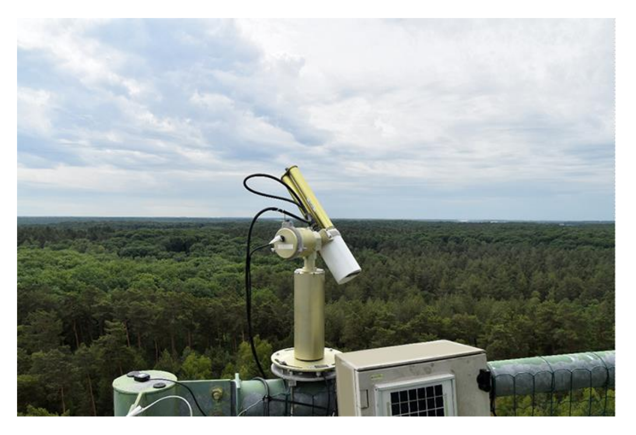
Photometer monitoring aerosol concentrations over Rambouillet forest from the ACROSS observation tower.