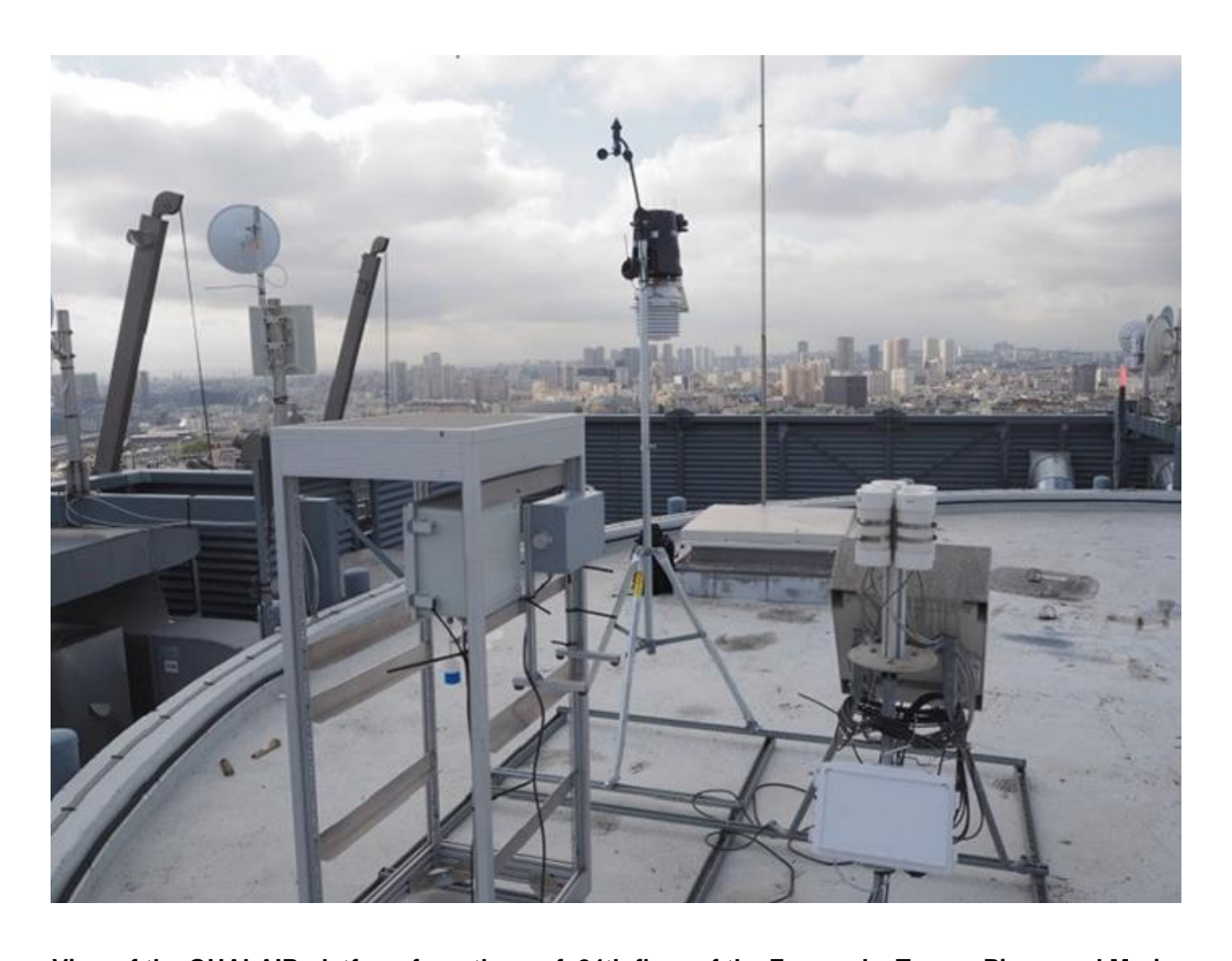
View of the QUALAIR platform from the roof, 24th floor of the Zamansky Tower, Pierre and Marie Curie campus, Université Sorbonne, Paris 5th arrondissement.