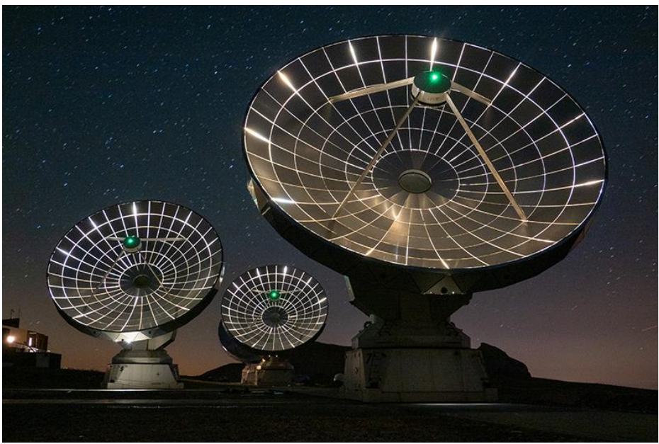
Three of the twelve antennas of the NOEMA radio telescope array.