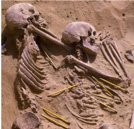
Archival photograph illustrating the double grave of individuals JS 20 and JS 21 with pencils indicating the position of associated lithic artefacts.

2 Information from comparisons with experimental archaeological work on hunting techniques.