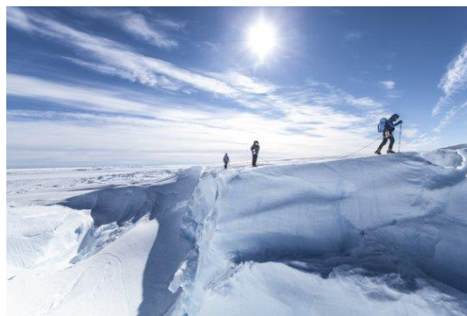
Glaciologists on Astrolabe Glacier.