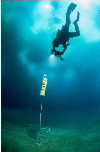
A diver checks and retrieves a hydrophone under the sea ice off Adélie Land.