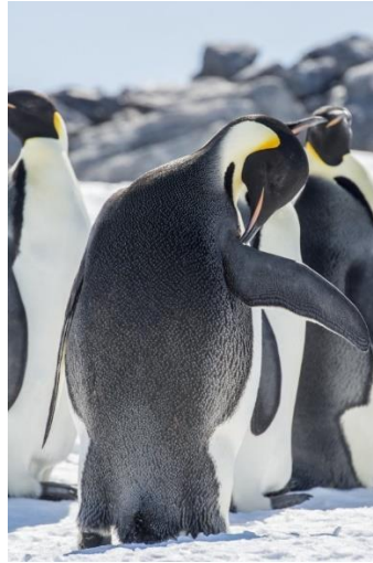
Adult emperor penguins near Dumont d'Urville Station in Adélie Land.

For a wide selection of visuals available upon request, e-mail presse@cnsr.fr .