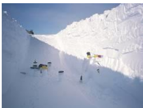
Collecting micrometeorites in the central Antarctic regions, at Dome C in 2002. Snow sampling.

5- 1 micrometre ( \mu\text{m} ) is equal to 0.001 millimetres, or one thousandth of a millimetre.