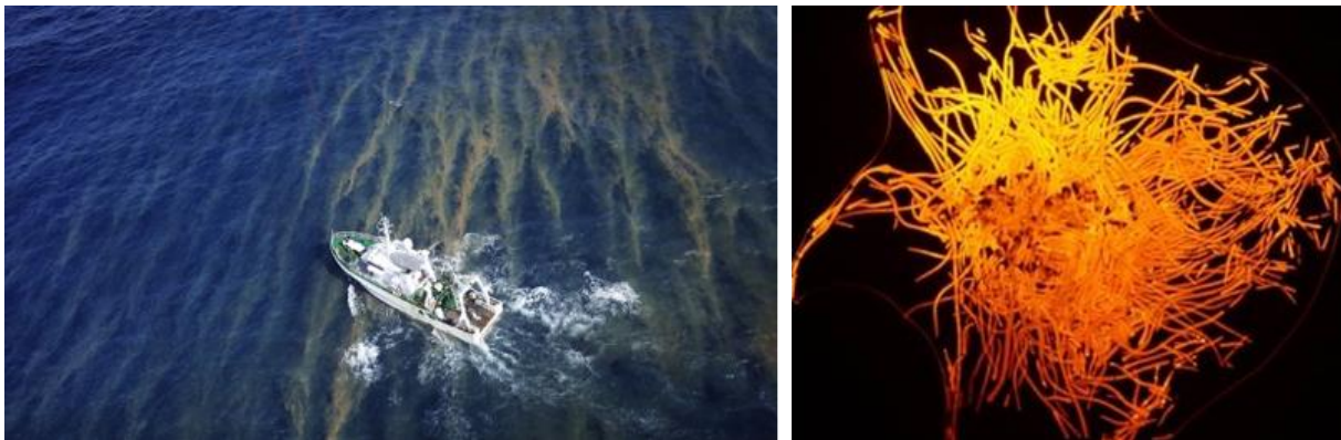
Left: Phytoplankton (nitrogen-fixing Trichodesmium cyanobacteria) bloom in the south-west Pacific.