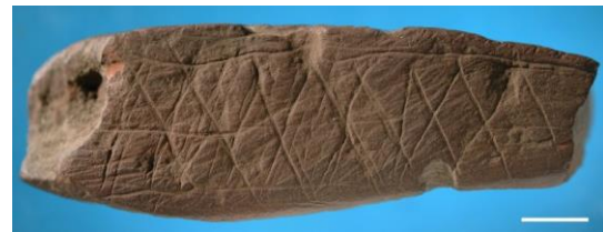
An abstract pattern has been engraved on this piece of ocher found at Blombos Cave in the same archaeological stratum that yielded the silcrete flake.