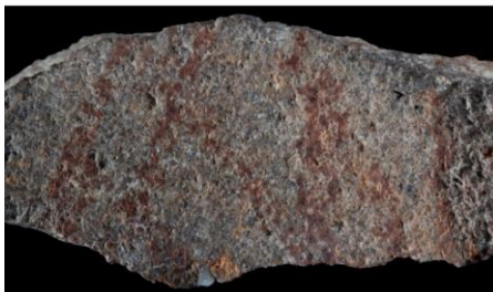
This silcrete flake displays a drawing made up of nine lines traced on one of its faces with an ochre implement.