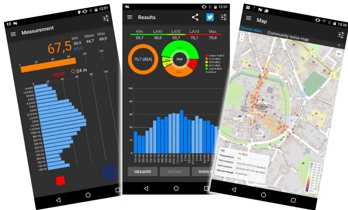
Screen shots from the NoiseCapture application