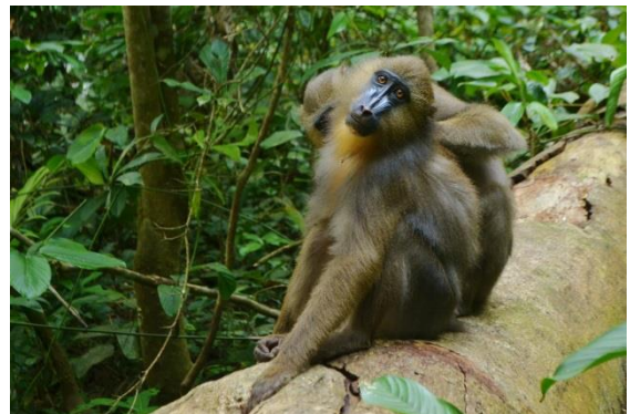
Mandrill grooming sessions.