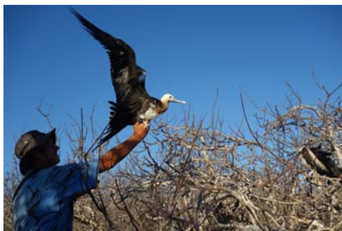
A juvenile frigate bird is released after being equipped with a tiny Argos transmitter

This study raises numerous questions regarding the capacity of frigate birds to sleep in flight and resist the extreme conditions encountered within cumulus clouds, as well as the strategy they use to avoid tropical cyclones in their path.