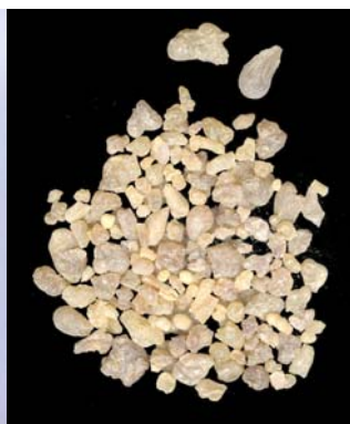
Frankincense gum-resin