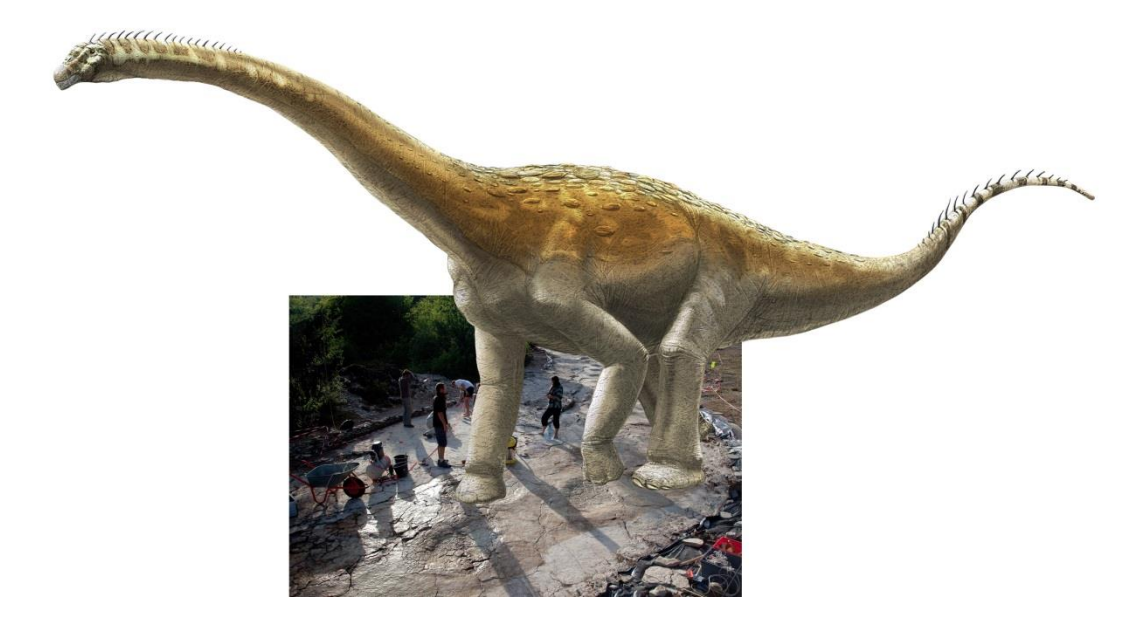
Artist's impression of Plagne sauropod superimposed on its tracks. © Drawing: A. Bénéteau; photo: Dinojura.